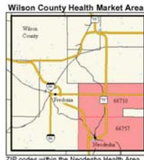
ZIP codes within the Neodesha Health Area.