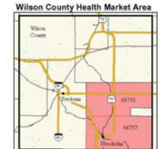
ZIP codes within the Wilson County Health Area.