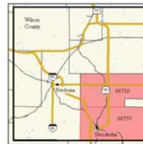
ZIP codes within the Neodesha Health Area.