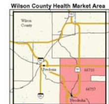
ZIP codes within the Wilson County Health Area.